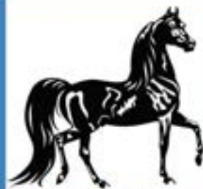
The Oregon Morgan Classic

Featuring Morgan & American Saddlebred Horses